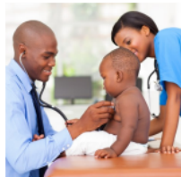
Sending medical aid