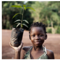
Planting fruit trees